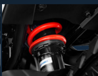
MONOSHOCK ADJUSTABLE TO 10 POSITIONS

*Reference photographs, models may vary depending on the country.